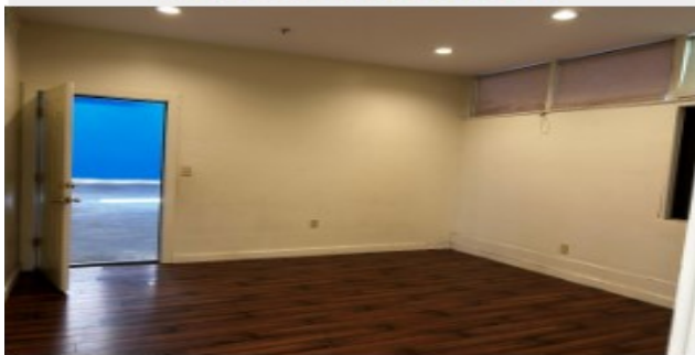
LOCKER ROOM & 2 BATHROOMS