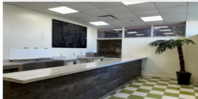
SIDE KITCHEN AREA